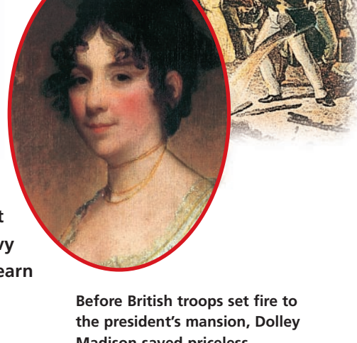
Madison saved priceless historical objects.

When the British troops arrived in the city, they set fire to many public buildings, including the White House and the Capitol. The next day, a violent storm caused even more damage. Fortunately, the heavy rains that accompanied the storm helped put out the fires. You will learn about other events of the War of 1812 in this section.